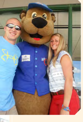
Aboard the Bus ... On our way!