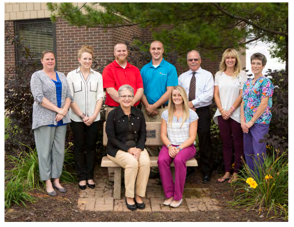
The LifeChoices® at Bethany team

Those of us around 60 and older begin to think seriously about what the rest of our lives will be like. We learn about Medicare and make decisions about Social Security. We often get our second wind and begin to take our wellness seriously. We consider moving someplace warm or downsizing or fixing up our home to stay close to our friends. Most of us want the latter. We wonder how much we will see our children and grandchildren. They often live so far away. We are thoughtful about who will be there for us. We wonder if our money will last a lifetime. We think about the cost of everything. The dilemmas of