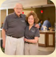
Stories from our donors ... p.6-7