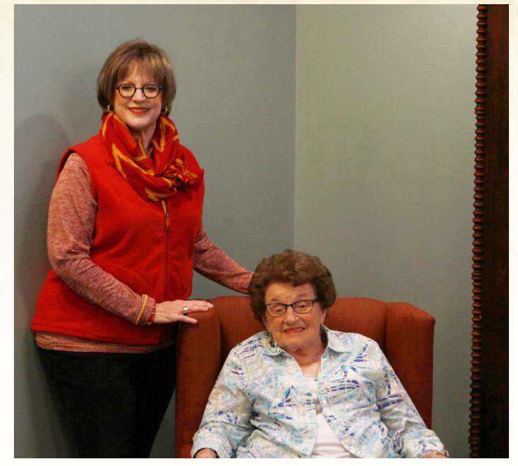
How do you see the Household Model at work every day?

My husband and I love to travel and meet new people. We love Arizona. We are both retired now, so this year we went for five and a half weeks. We plan to go back again soon and plan to go for another five or six weeks. We're going to try Orange Beach. We're not beach people, but we are going to give the beach a try. We also want to see some national parks and make it up to Maine. Some people are bored in retirement – I'm not bored in retirement.