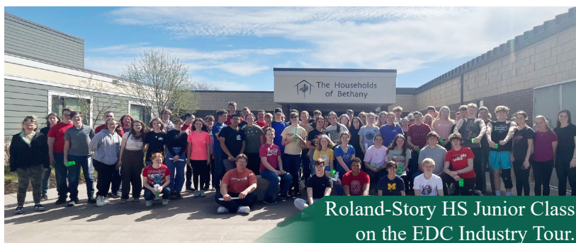
Roland-Story HS Junior Class on the EDC Industry Tour.

In April, the halls of Bethany Life echoed with the energy of a hundred students from the Junior class at Roland-Story High School. As they embarked on their tour of The Households of Bethany, their eyes were opened to the multitude of departments and trade jobs that could lead them towards meaningful and fulfilling careers. Amidst their youthful uncertainty about their future paths, they found solace in the knowledge that Bethany Life provided them with viable options within their community. The visit instilled a sense of hope