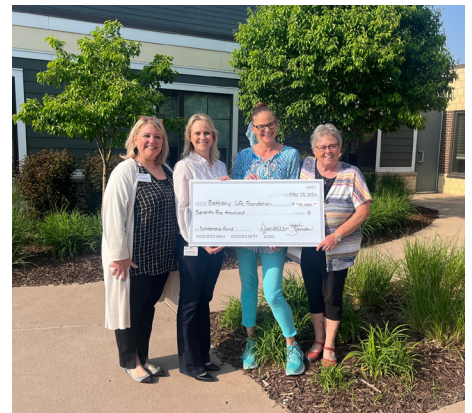
Affordables donation of $75,000

In April we hosted our annual Palm Sunday Brunch in person for the first time in several years. We were overjoyed at the crowd we received while we served up fresh pancakes. It was nice to see so many people in the building for an event like that again. Around the same time our Easter Appeal went out and we were blessed, once again, by the response of generosity. The funds we receive for our Easter Appeal directly supports our Chaplaincy Endowment, which ensures the future of the Chaplaincy