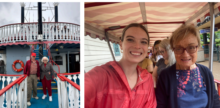
LifeChoices® members on a trip to St. Louis

On Thursday, July 13th, from 4-7 pm, LifeChoices® will hold its 10-year anniversary celebration at Reiman Gardens in Ames. We are inviting our members and community to come and celebrate with us as we congratulate and thank everyone who has made this all possible.