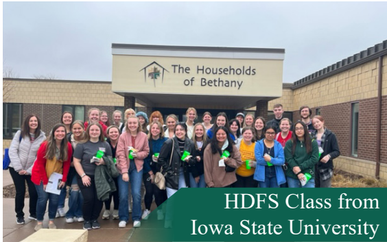
HDFS Class from Iowa State University

Bethany Life has become a guiding light for the younger generation, igniting their passion and inspiring them to explore the vast possibilities within the healthcare industry. Through a series of educational tours, Bethany Life has opened its doors to eager students, nurturing their dreams and guiding them towards fulfilling careers.