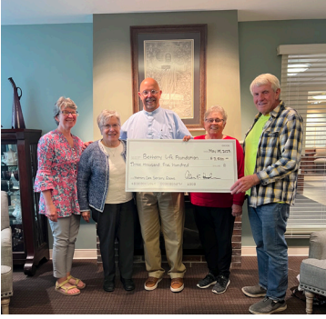
Bethany Life Volunteers Donation

program here at Bethany Life. Our Chaplain plays such an integral role to all of the residents, tenants, members, and clients in the Bethany Life continuum. We are so grateful for the support we receive for the endowment.